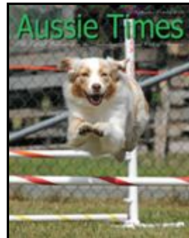
Summer – ATCH-IV!!

In Rally, Halley completed her RMX at the April 20 - 21 shows in Seekonk, MA and then went on to earn her REM at the May 5 trial in Goshen, CT. Along the way she took High in Trial twice, High Aussie twice and High Combined four times.