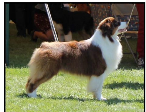
New ASCA CH Equinox Enjoy The Ride (Trek)!

Trek finished his ASCA Championship at 14 months old in a few weekends of showing. CH Equinox Enjoy The Ride